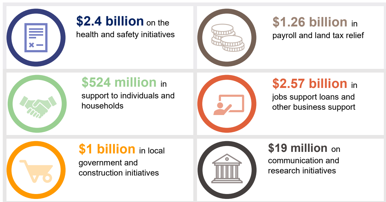
Figure 2A Snapshot of spending on COVID-19 initiatives as at 31 December 2021

Source: Queensland Audit Office, based on data provided by Queensland Treasury with input from the entities managing the initiatives.