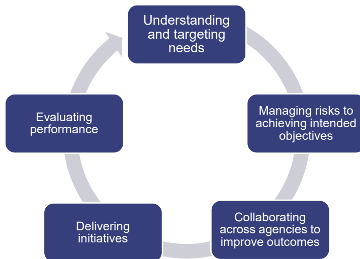
Figure 3B Key areas of learning for current and future initiatives